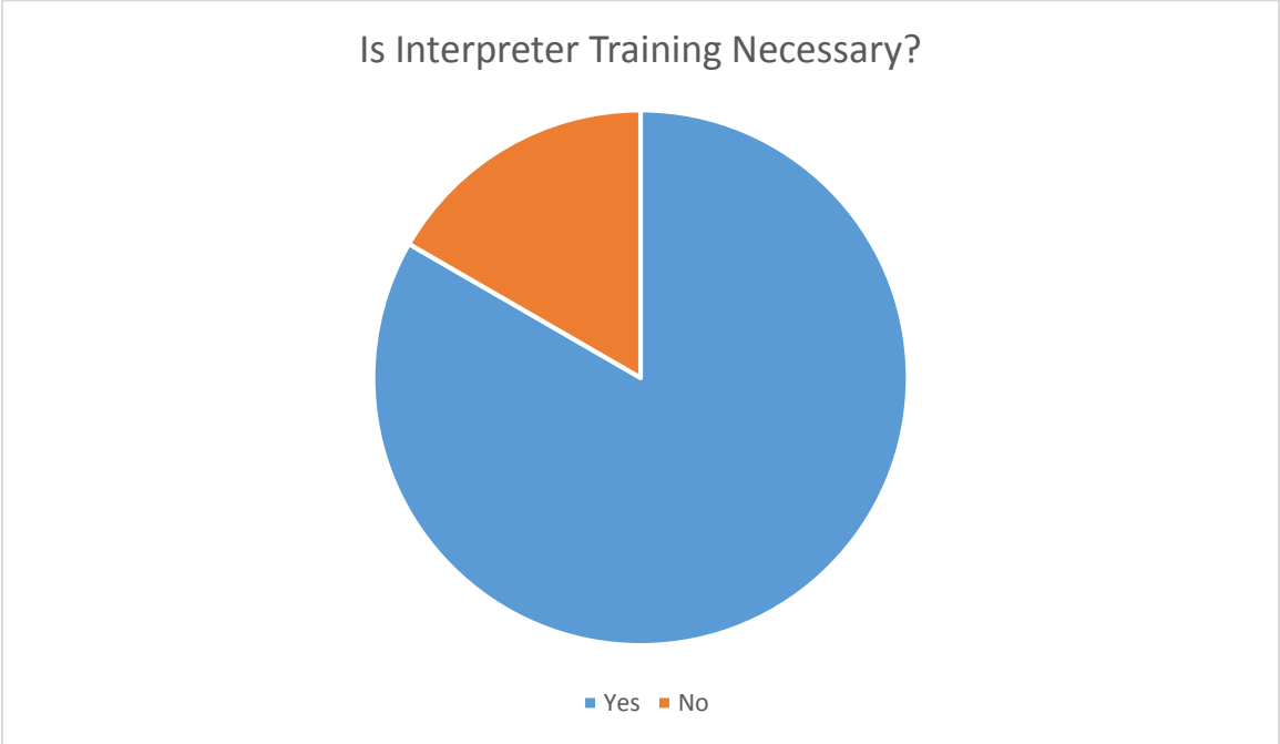
Figure 4. 2 Do We Need Trained Interpreters?