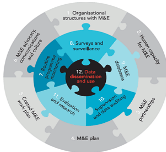
Figure 2.1: Structure of a well-designed M&E system (Third One).

Below is a detailed discussion of the twelve M&E components.