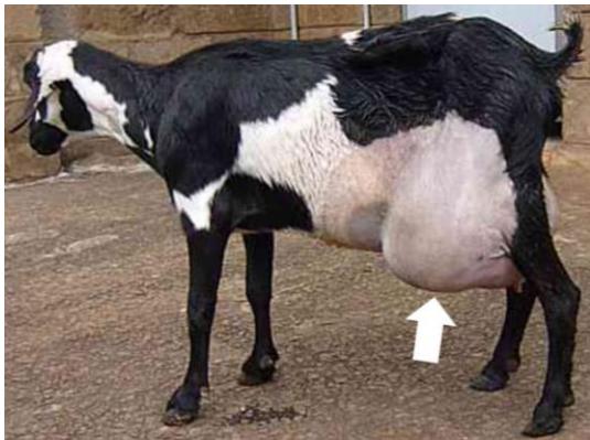
Fig.1: photograph of a doe showing the ventral abdominal hernia